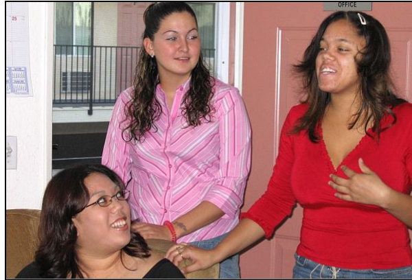
Family atmosphere and support is encouraged.

SafeHouse established the “Main Street” Transitional Living Program in 2002. With the help of several agencies, SafeHouse purchased and renovated an apartment complex to assist 20 homeless youth and their children, particularly those making a transition from foster care or other institutional care to independent living. The Main Street TLP assists Riverside County homeless youth deal with barriers to independent living (i.e. substance abuse, mental health and unemployment). Many of these youth are without mentors or role models. This project helps young adults through an 18-month program to develop independent living skills that foster their movement along the continuum to permanent housing and self-sufficiency.