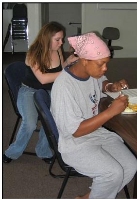
Residents of the TLP gather together for a summer barbeque.

Education remains a key component of our program. All youth entering the program develop educational plans and goals. A full-time Life Skills and Education Coordinator allows us to offer a variety of life skills classes and support services dealing with employment, job retention and career development. These services have resulted in employment for 24 of the 35 exiting clients. The Transitional Living Program was also honored to partner with several local corporations such as Lennar Homes, Union Bank of California and Riverside Community Health Foundation. Change A Life Foundation was instrumental in assisting one of our clients with tuition to a vocational college where she will receive her certification in medical assisting and setting up a child care fund for our single mothers in the program so that they could search for employment or attend school until their aid came in.